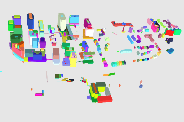
Figure 2: a) VRML Graphics model of Rosslyn, VA. b) Solid CAD model computed from the graphics model.